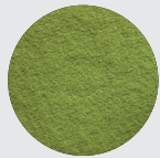
GREEN 3000 GRIT