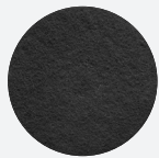
BLACK 100 GRIT