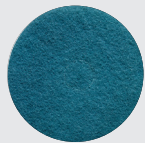
BLUE 800 GRIT