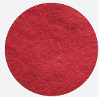
RED 400 GRIT