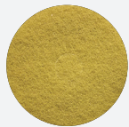
YELLOW 1500 GRIT