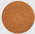
ORANGE 200 GRIT